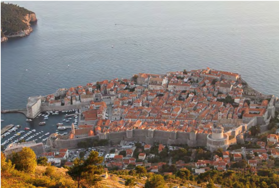
Old City of Dubrovnik